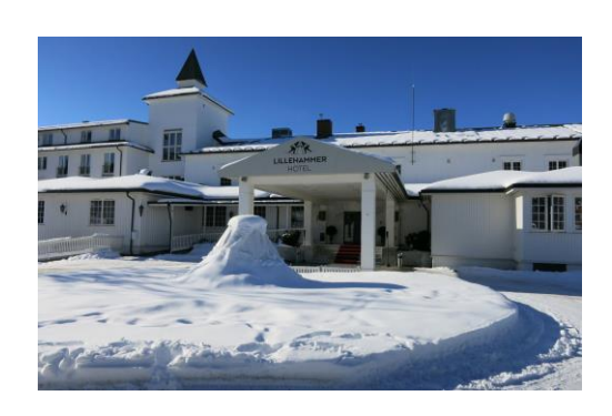
Scandic Lillehammer Hotel, Lillehammer Raw Air Men